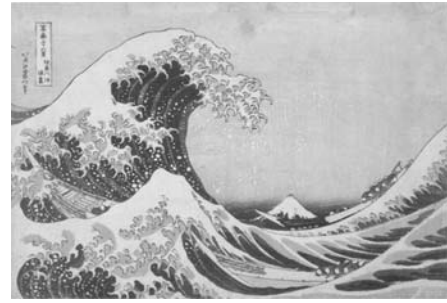
Figure 1. Turbulent action on many different scales in a high Reynolds number flow: woodcut print by Katsushika Hokusai (1760–1849).

Kolmogorov’s idea was that the velocity fluctuations in the inertial subrange are independent of initial and boundary conditions (i.e., they have no memory of the effects of anisotropic excitation at smaller wave numbers). The turbulent motions in this subrange therefore show universal statistics and the flow is self-similar. From this premise Kolmogorov proposed the first hypothesis of similarity as: “For the locally isotropic turbulence the [velocity fluctuation]